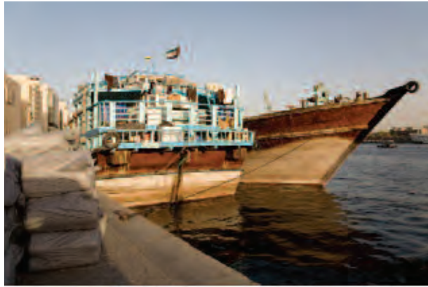
The bow and stern of two cargo dhows moored in Dubai Creek.

to Dubai are subject to inspection and compared to the commercial invoice/packing list. Discrepancies may cause delays and possible additional costs and fines. Exhibitors should take great care to be exact in descriptions and quantities.